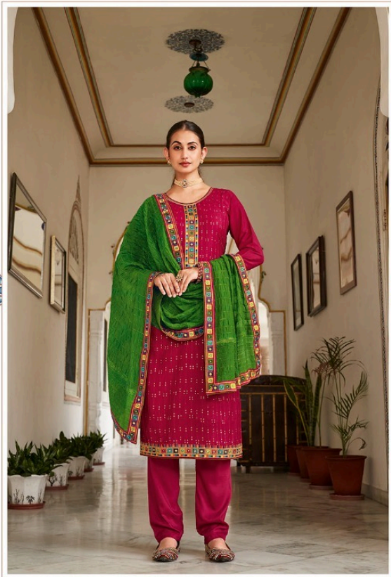
Elegance & sophistication create a charming symphony.