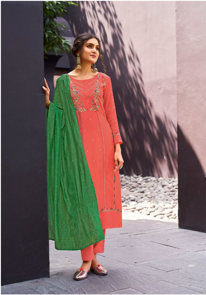
Different cultures come together in a trillite in fashion's biggest moment this season 3251