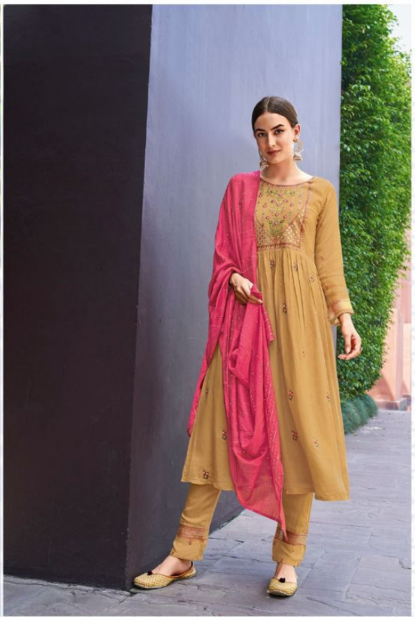
The vibrant palette in shades of red, pink, magenta come to life with highlights