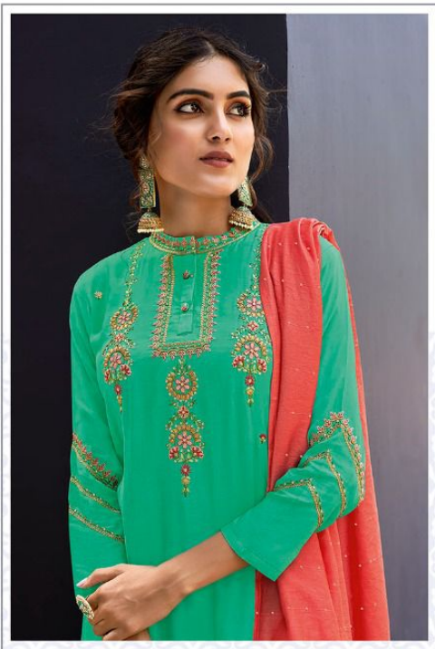
Classic style with luxurious soft fabrics are highlighted by vibrant and feminine details 3254