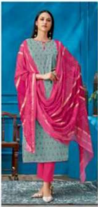
D.No. | 1001