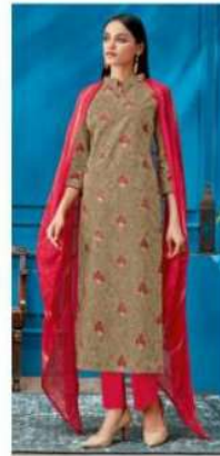
D.No. | 1007