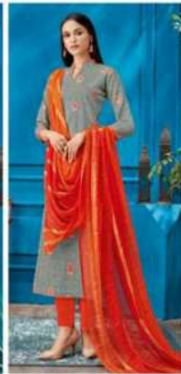
D.No. | 1003