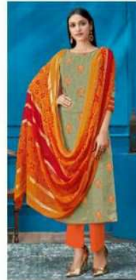
D.No. | 1008