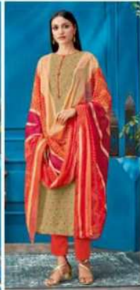
D.No. | 1005