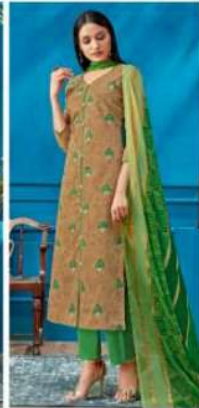
D.No. | 1006