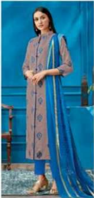
D.No. | 1004