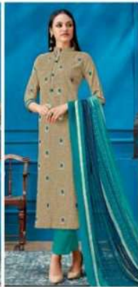
D.No. | 1002