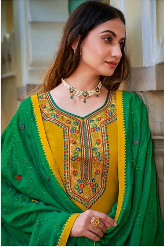
GLAM — 3352 — DIVA