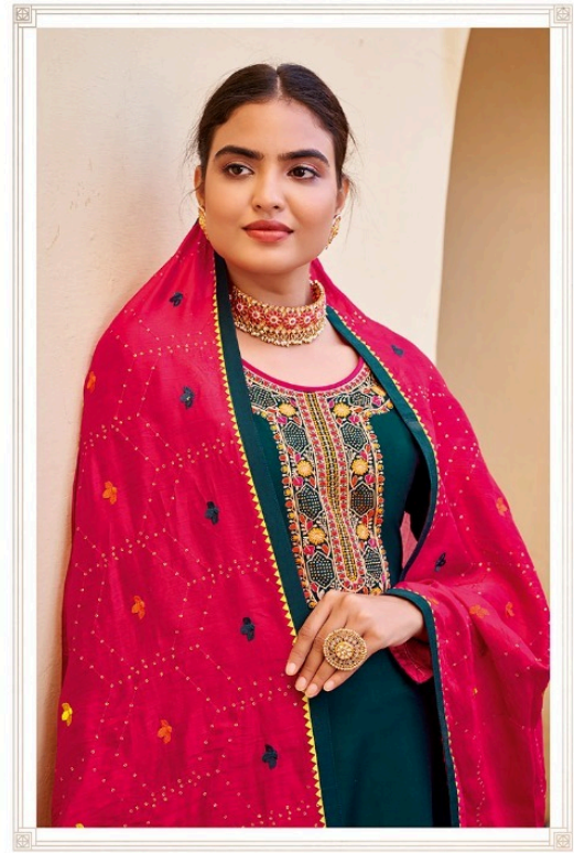
GLAM — 3351 — DIVA