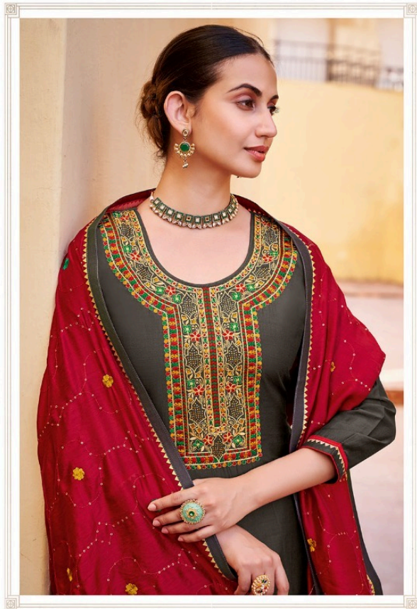
FREE — 3353 — SPIRIT