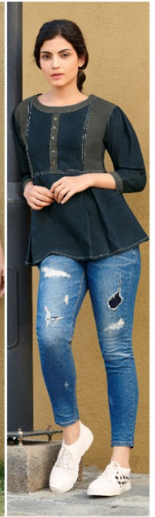
DESIGN - 8006