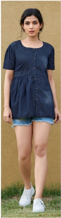
DESIGN - 8002