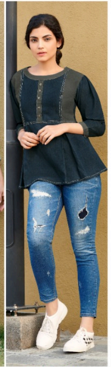
DESIGN - 8006