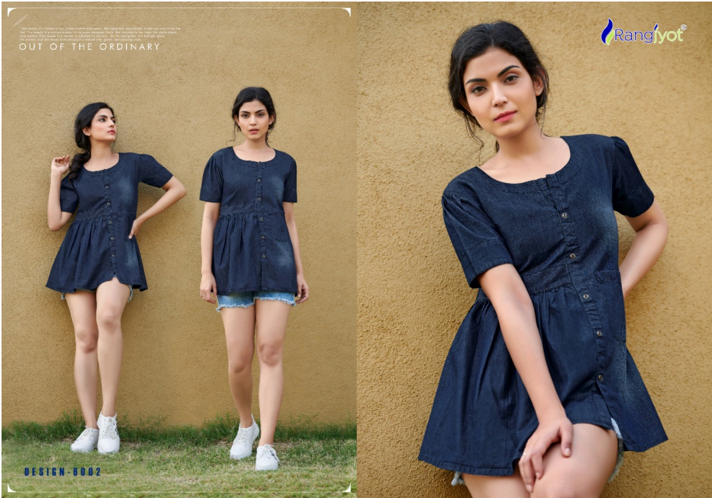
DESIGN - 8002