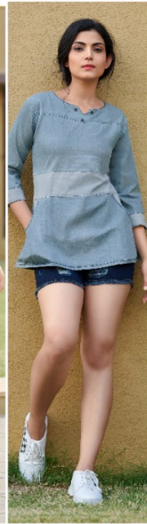
DESIGN - 8005