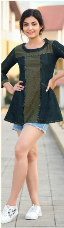
DESIGN - 8003