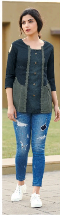
DESIGN - 8004