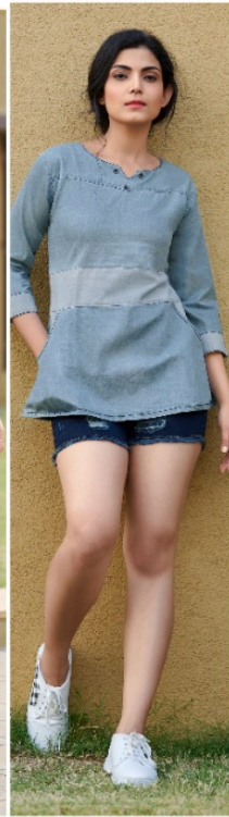
DESIGN - 8005