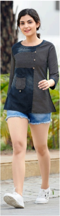
DESIGN - 8001