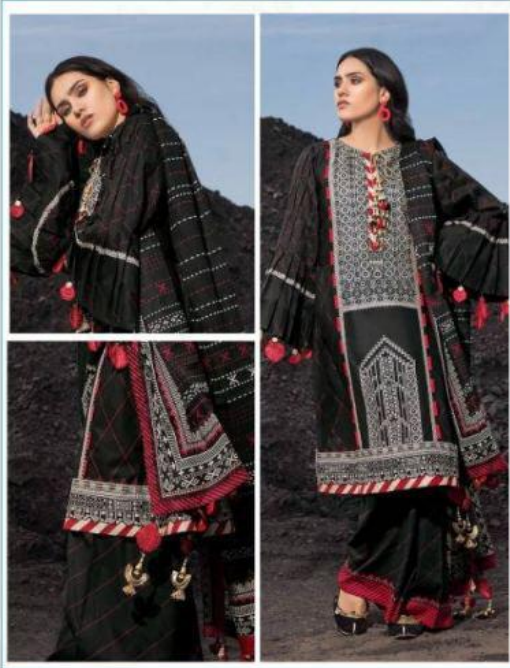
Riwayat-é-Pashk ❀❀❀ D.No.73005 ❀❀❀ GUL AHMED