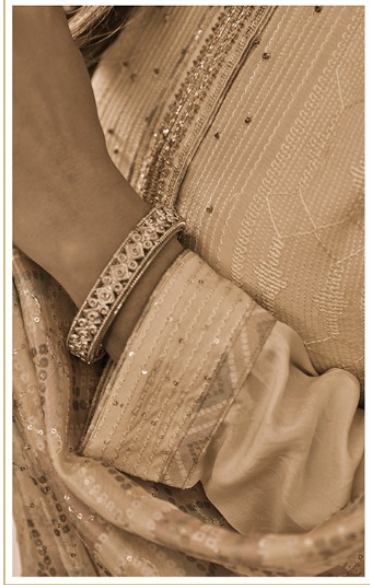
D.No : 3212