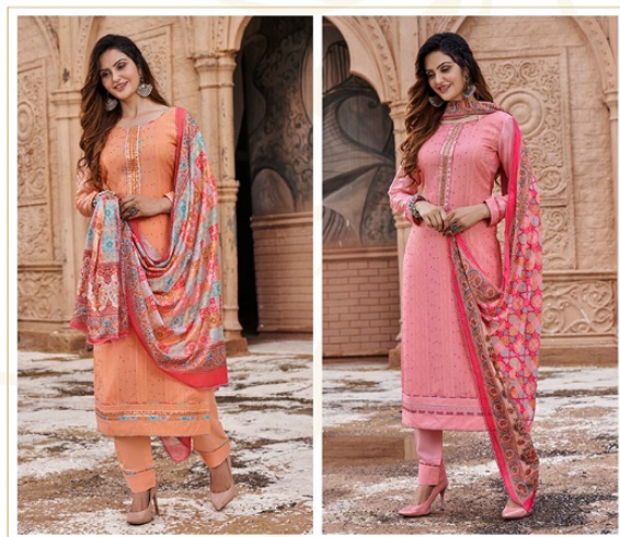
D.No : 3213