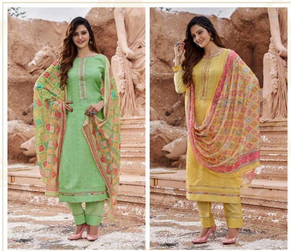
D.No : 3211