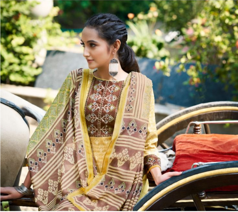
She is a Dreamer, a Doer, a Thinker, She sees possibilities everywhere. DREAMER