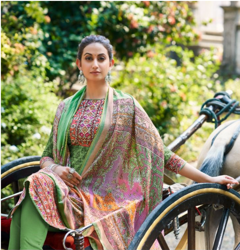
She is rare, she is real; she is a poetry, which has all emotions!