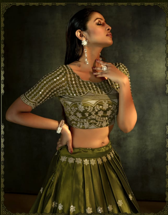
celazy An ecstasy of timeless style.