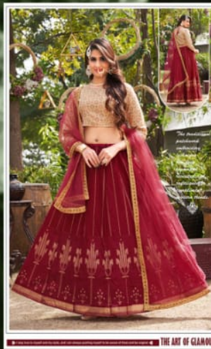
THE ART OF GLAMOUR