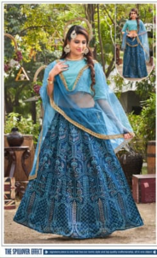
THE SPILLOVER EFFECT