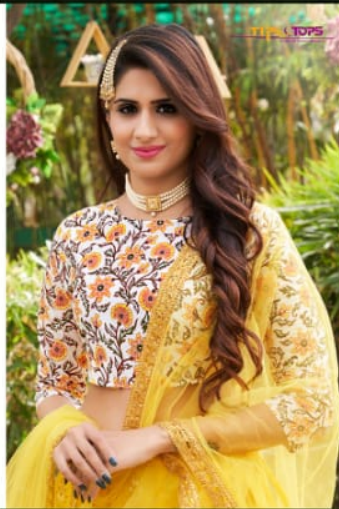
TIPS & TOPS