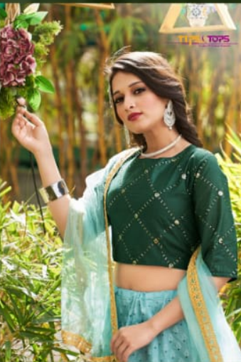
TIPS & TOPS