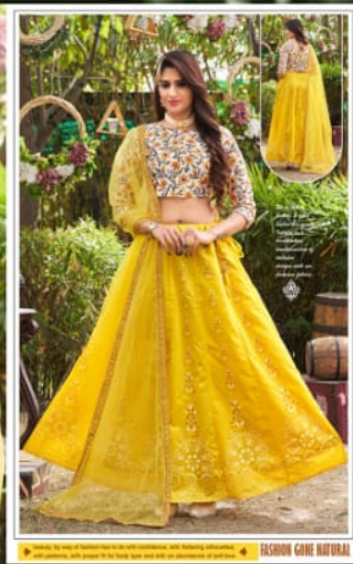
FASHION GONE NATURAL