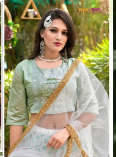
TIPS & TOPS