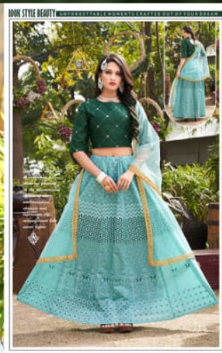
LOOK STYLE BEAUTY