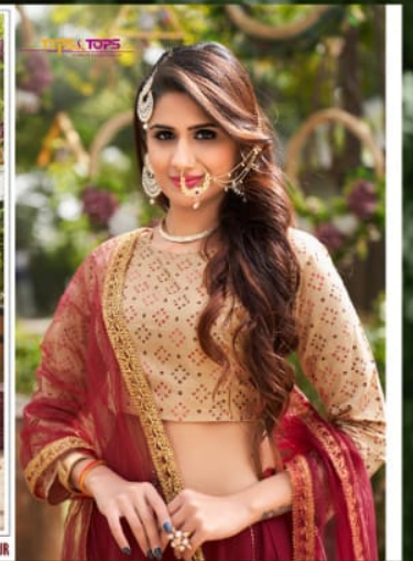
TIPS & TOPS