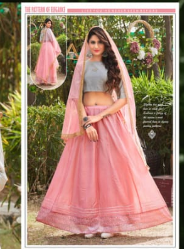
THE PATTERN OF ELEGANCE