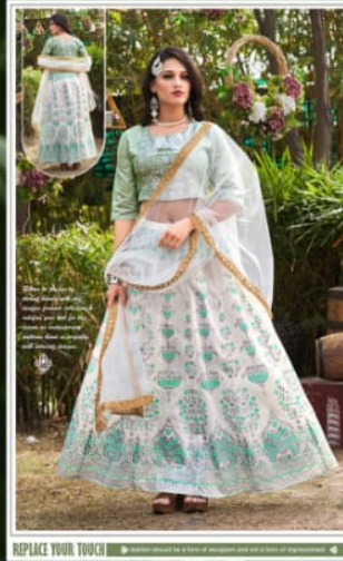
REPLACE YOUR TOUCH