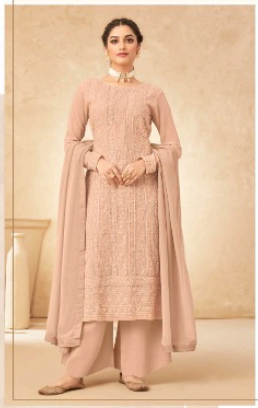
-: 41013 :-