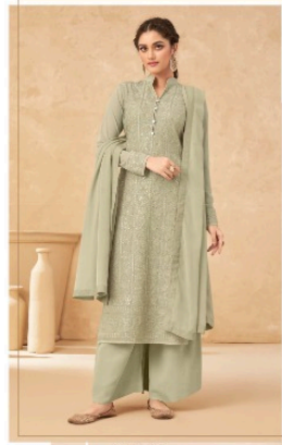
-: 41015 :-