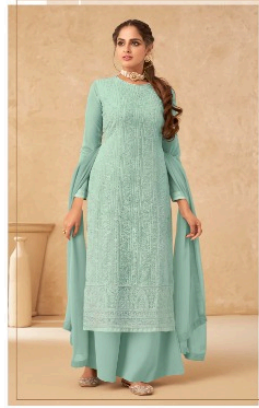
-: 41017 :-