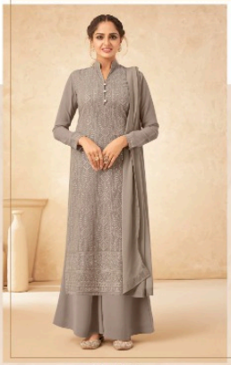
-: 41012 :-