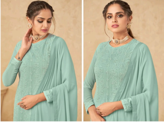
Fashion is not something that exists in dresses only. Fashion is in the sky, in the street. Fashion has to do with ideas, the way we live, what is happening.