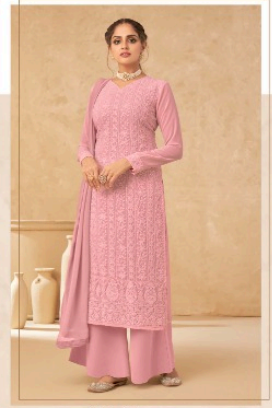
-: 41016 :-