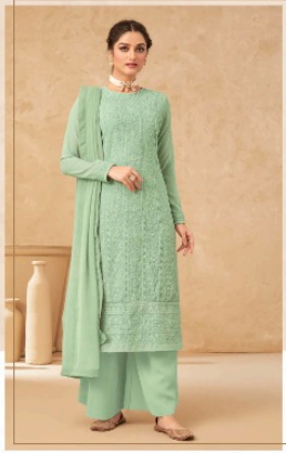
-: 41014 :-