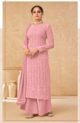
-: 41016 :-