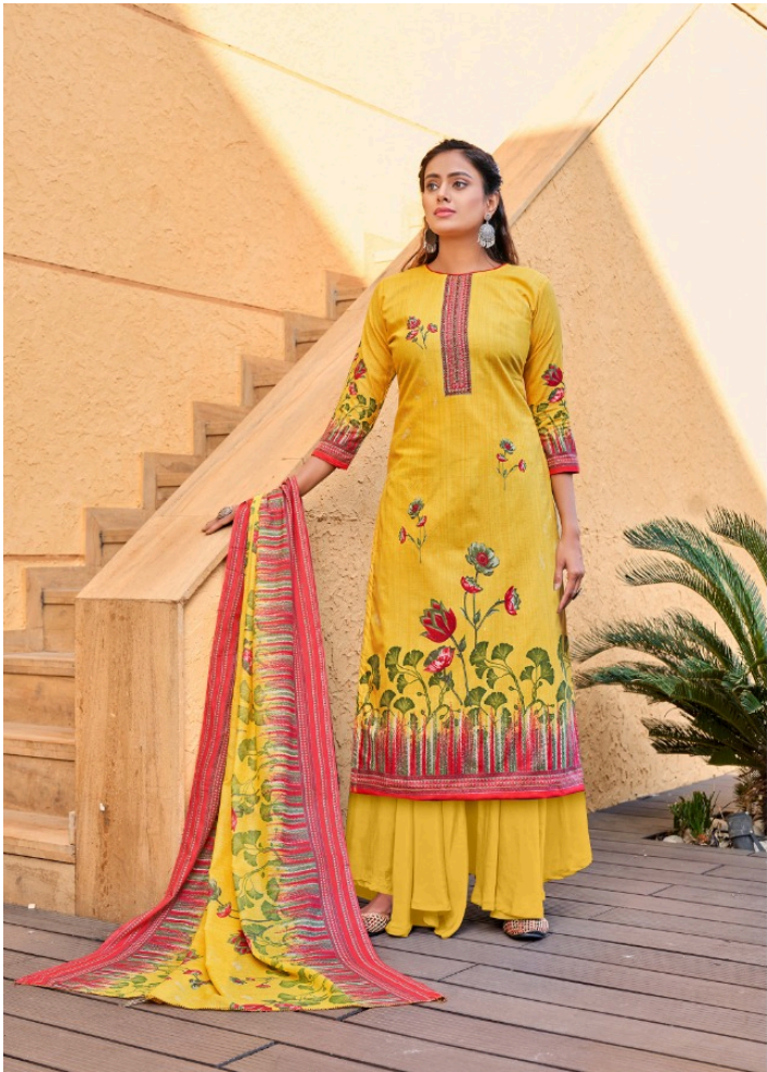
Luxurious Prabhasy A KLASORRER DRESS PRINTS WHICH IS IN THE TC D.NO 2004