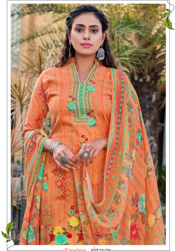
Timeless elegance A CLASSIC DESIGN BUILT TO LAST BY D.NO 2010