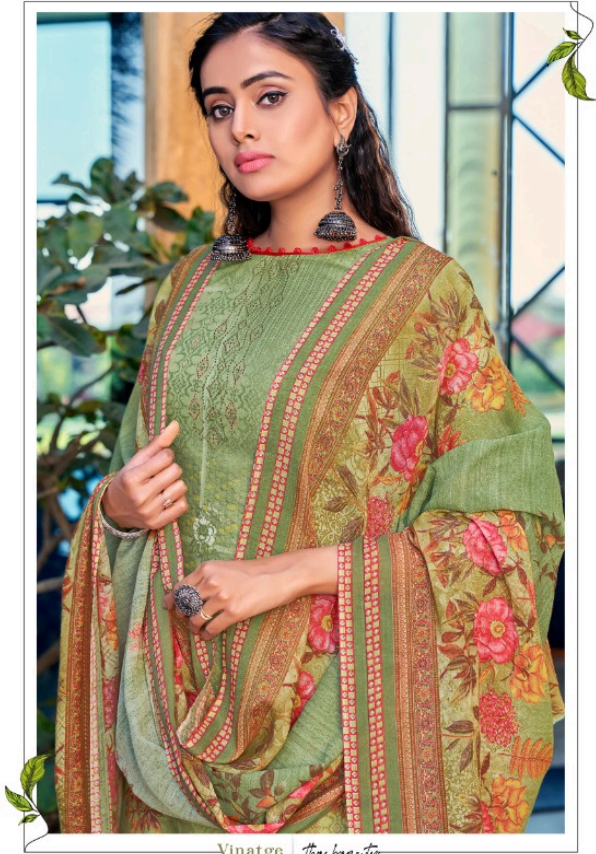
Vinatge the beauty A SHAMURDIN DRESS PRINTS WHICH IS AN ODE TO D.NO 2008