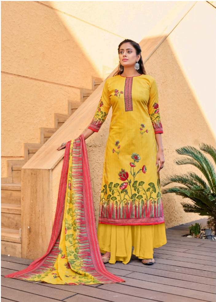
Luxurious Prabhasy A KLASORRER BRIDE PRINTS SERIES IN 100% TC D.NO 2004