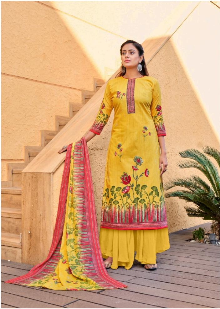
Luxurious Prabhasy A KLASORRER DRESS PRINTS WHICH IS IN THE TC D.NO 2004