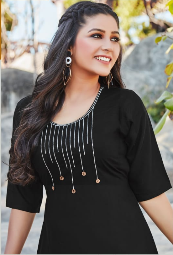
This dress and you are a match made in heaven. When you dress in this sublime creation, you transcend to a new pedestal.