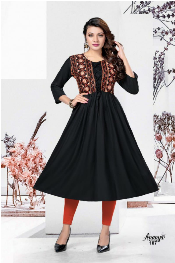
most stylish women graceful enlightenment with catchiest statement