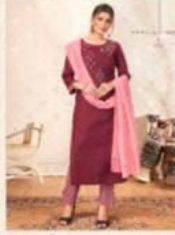
••• Design no. 1003 •••