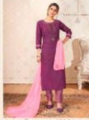
••• Design no. 1006 •••