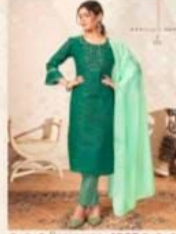
••• Design no. 1007 •••