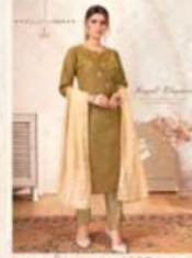
••• Design no. 1005 •••