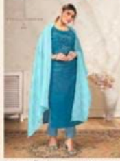
••• Design no. 1002 •••