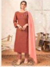
••• Design no. 1004 •••