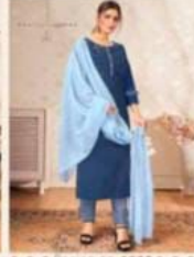
••• Design no. 1008 •••