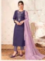
••• Design no. 1001 •••