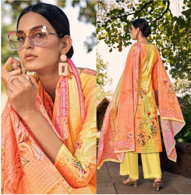
GARMENT STYLE 19002