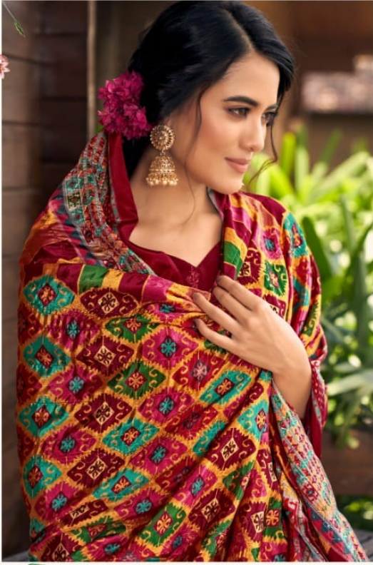
simplicity and elegance peering out of the innermost pink and the vicarious floral design.