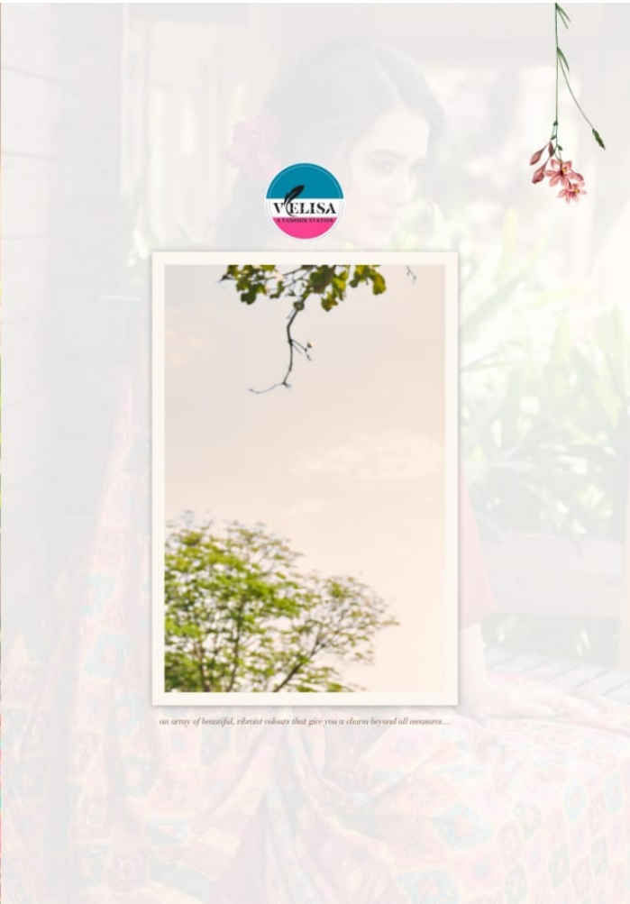
an array of beautiful, vibrant colours that give you a charm beyond all measures...