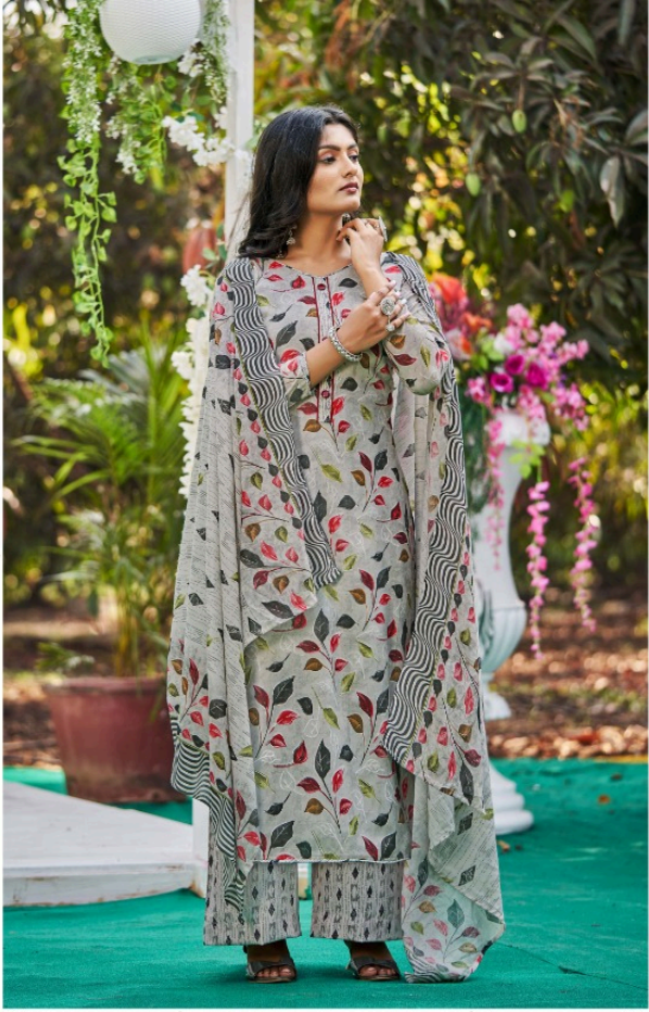
FASHION CHARM 502-003