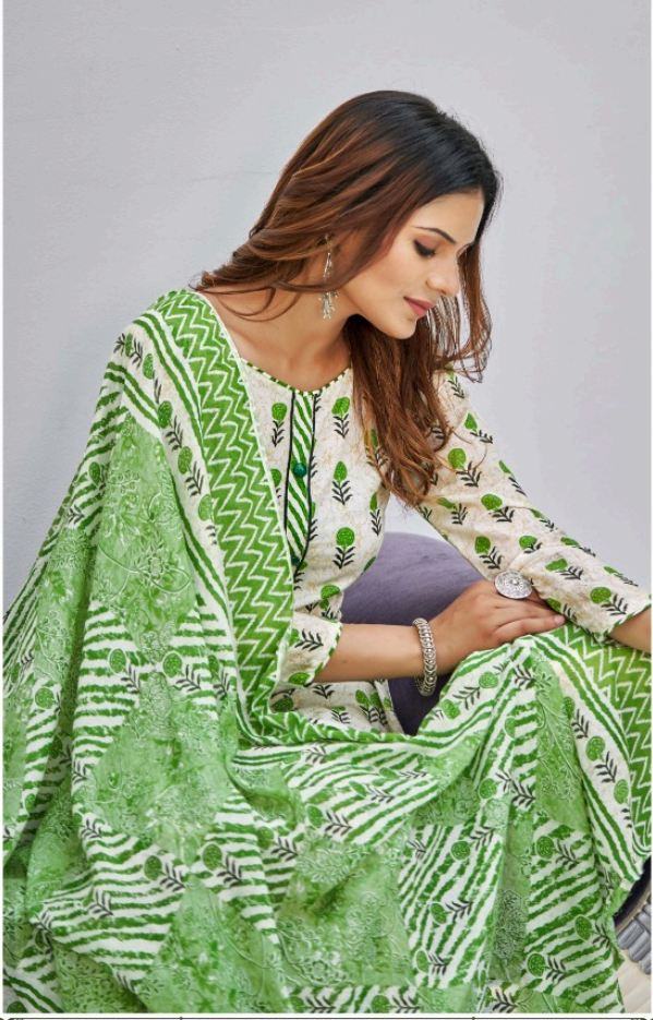
FASHION CHARM 502-006