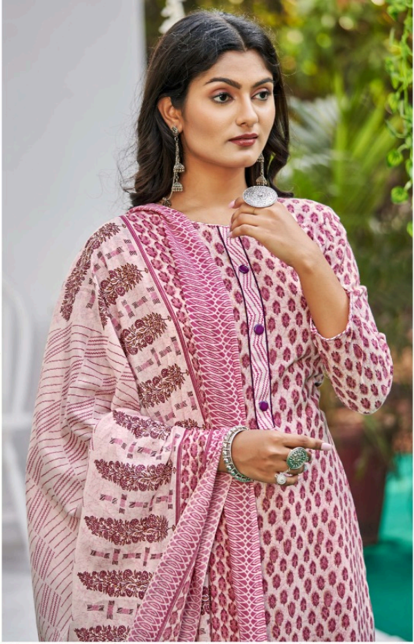
FASHION CHARM 502-001