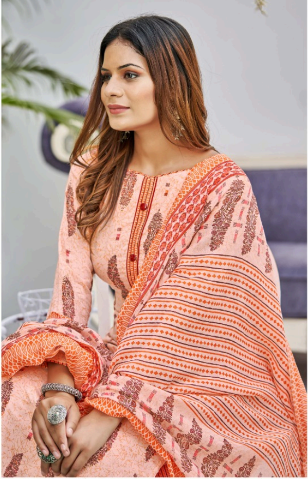
FASHION CHARM 502-010