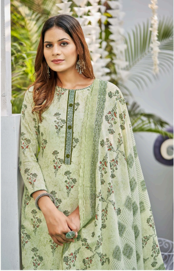
FASHION CHARM 502-008