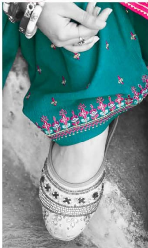
Brilliant hues & lustrous textures give you a new makeover this season