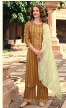
..D.NO - 1003..