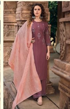
..D.NO - 1004..