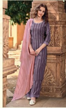
..D.NO - 1001..