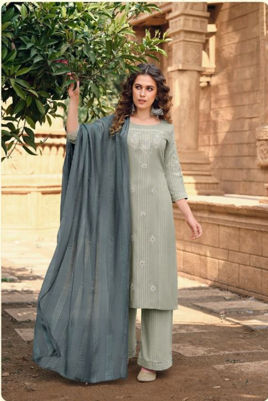
..D.NO - 1002..