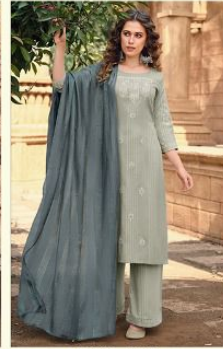
..D.NO - 1002..