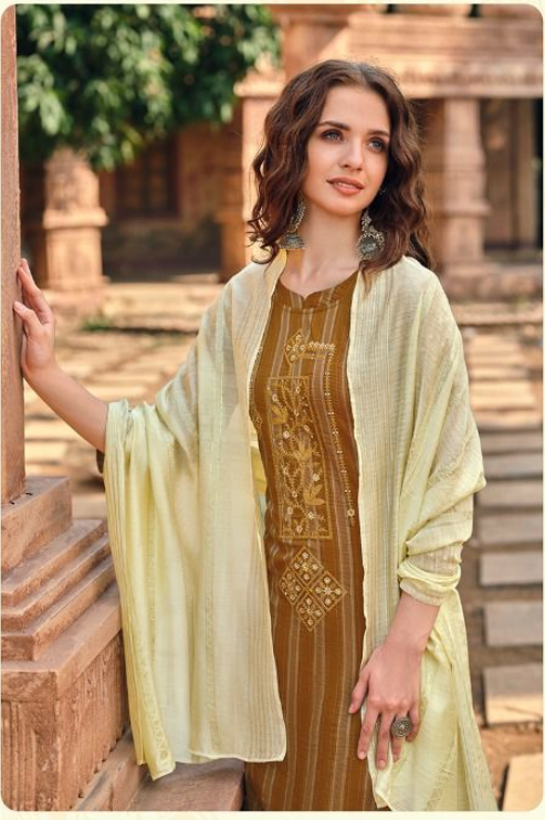
D.NO - 1001