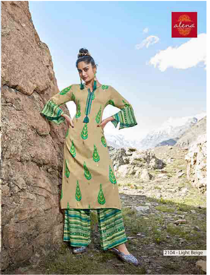
2104 - Light Beige