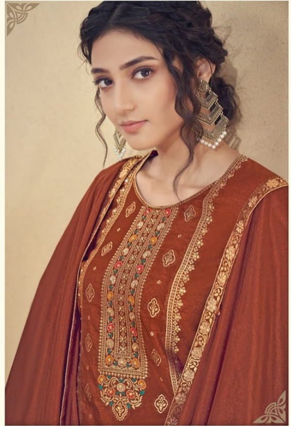
EFFORTLESS CALIBRE OF CREATIVITY WHICH FEATURES THE BEAUTY IN A PERSON WITH BEAUTIFUL GARMENT.