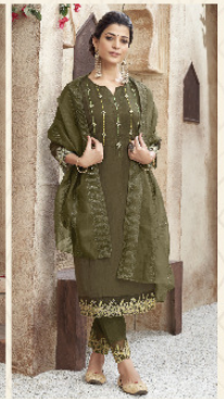
SHAK - 66