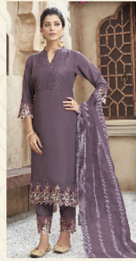
SHAK - 61

FABRIC Top & Bottom Are Chinon With Nylon Organza, Dupatta Is Viscose Organza VALUE ADDITION Embroidery with Heavy Handwork SIZE S, M, L, XL, XXL, XXXL