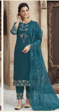
SHAK - 62