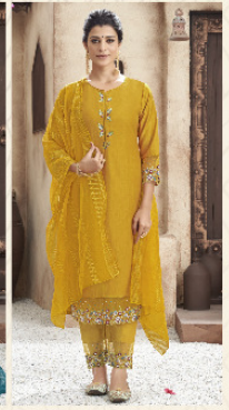
SHAK - 63