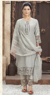
SHAK - 64