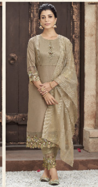
SHAK - 65