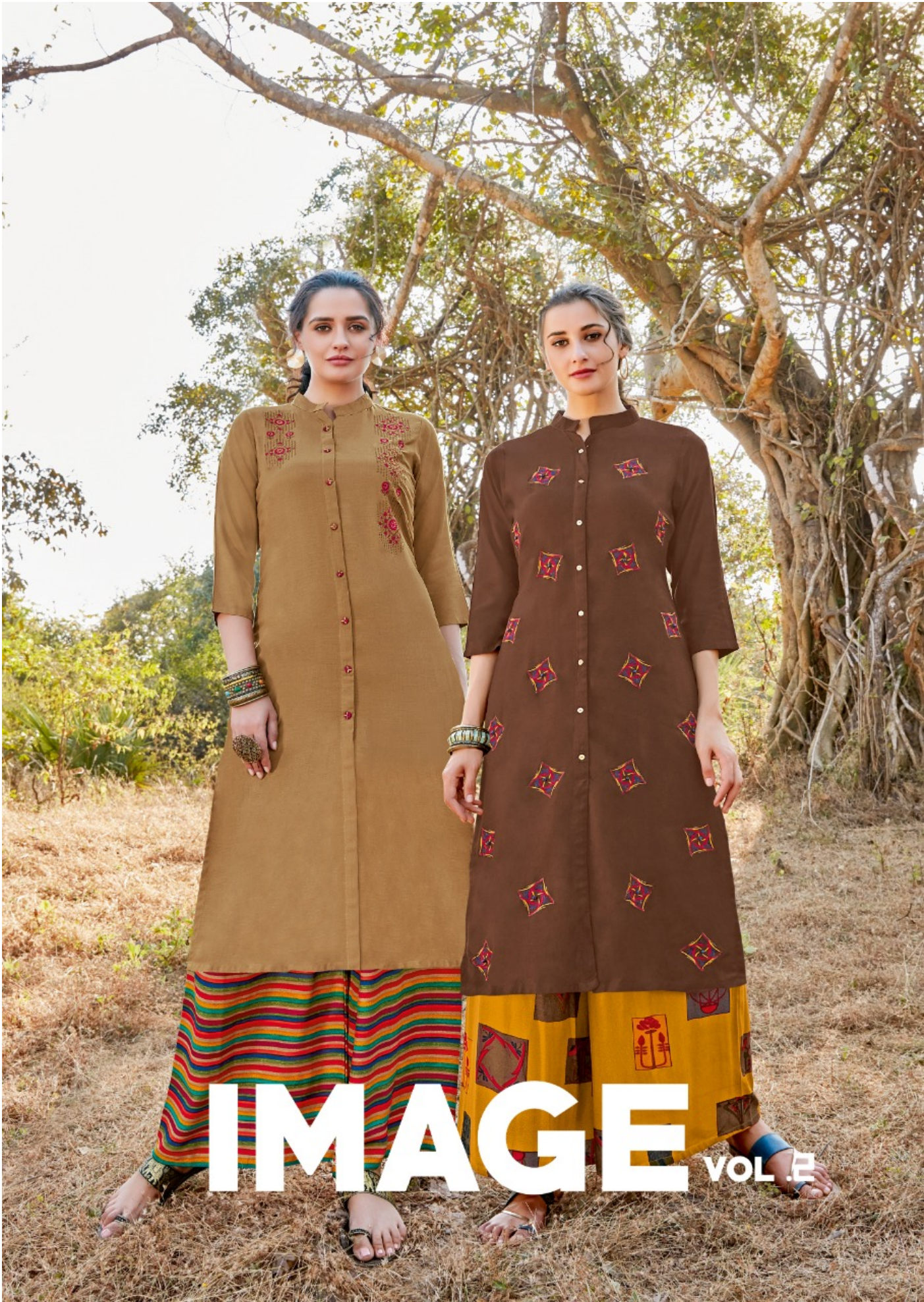
IMAGE VOL. 2