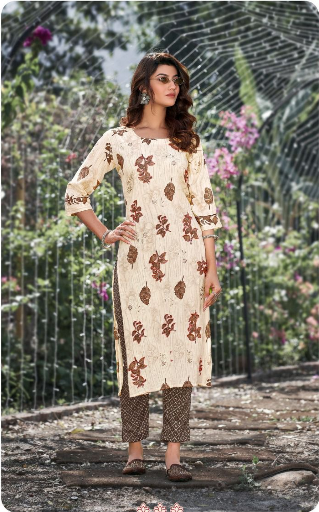
Gorgeous florals are finely sewn in this spectacular peach dress