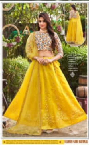
DESIGN CARE NARRATE