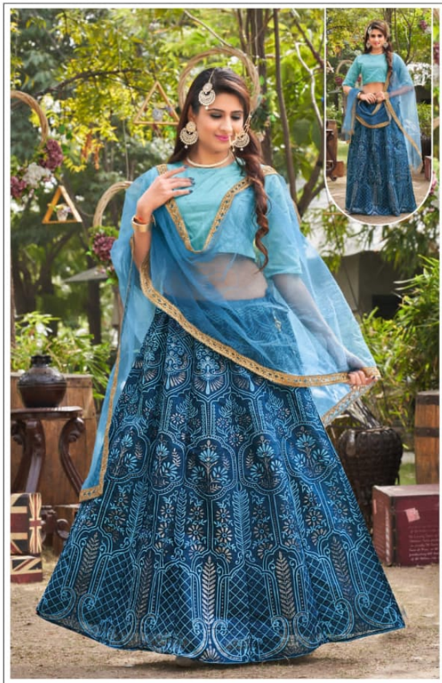
THE SPILLOVER EFFECT → signature piece is one that has our iconic style and top quality craftsmanship, all in one object ←