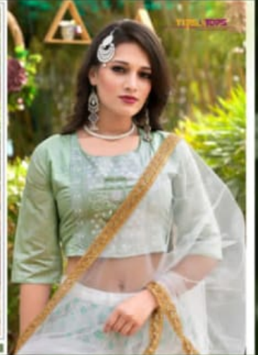
TOPS & TOPS