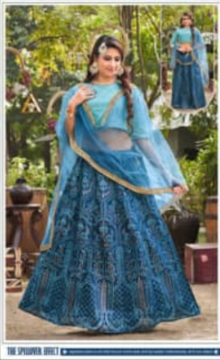
THE SPINNING WHEEL