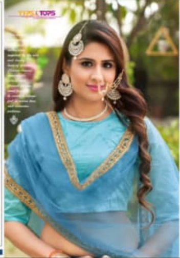
TOPS & TOPS