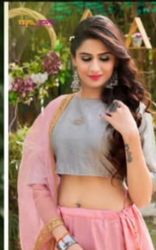
TOPS & TOPS