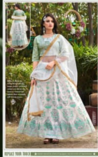
REPLACE YOUR TOUCH