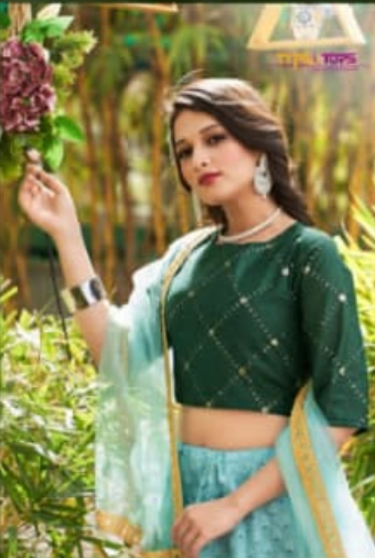
TOPS & TOPS