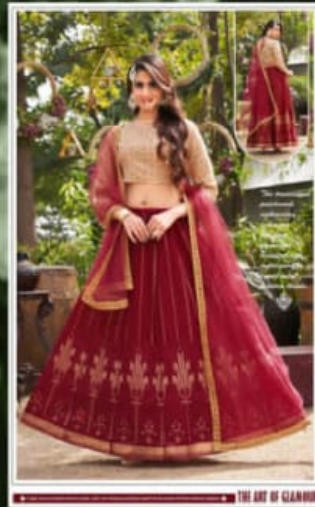
THE ART OF GLAMOUR