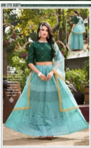
OWN STYLE BEAUTY