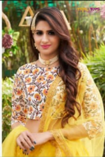
TOPS & TOPS