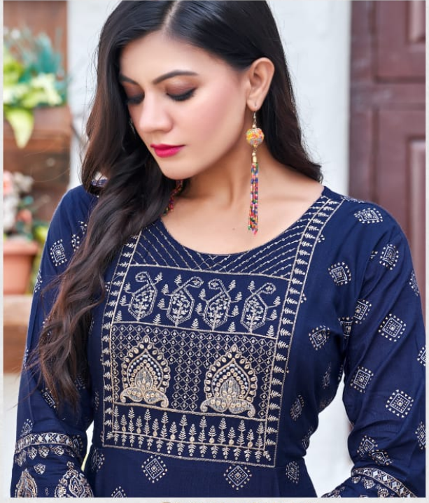
Traditional looks rule the season with a hint of modern-chic!