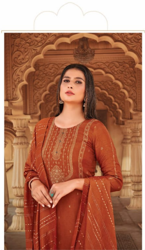
Classic style with luxurious softness highlighted by refined and feminine details