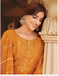
A round up of the hottest trends this spring season you the chosen ways to wear pastels gets