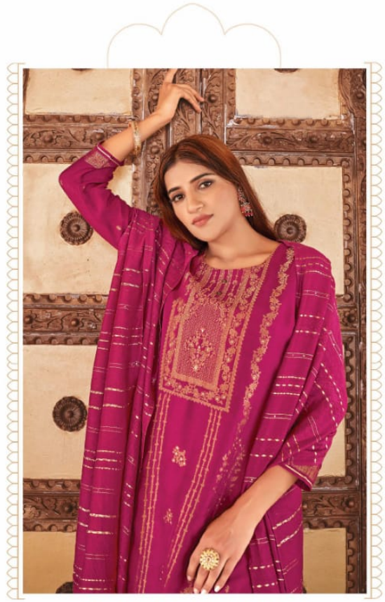
luxo fibrena bold patterns fi sumptuous detailing adoro modernu allhouattina