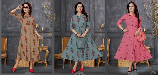
2333 DARK CHIKU