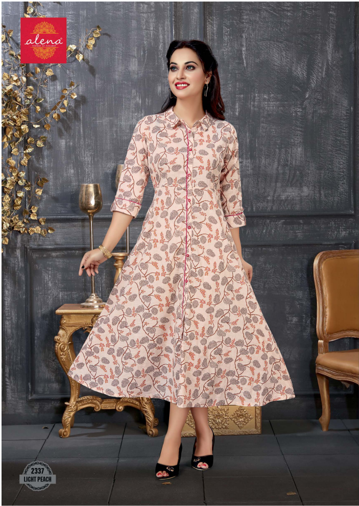
2337 LIGHT PEACH