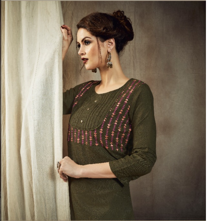
A scintillating plethora of timeless masterpieces inspired by beauty from Indian culture. 2001