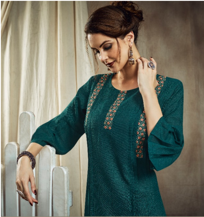
A breath taking array of fine detailing & intricate design inspired by Indian culture. 2001