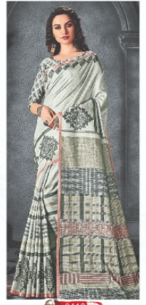
6412 ( MANIPURI SILK )