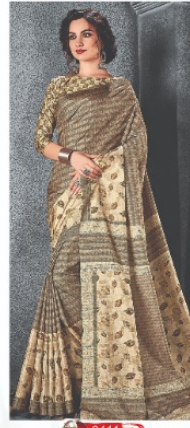
6411 ( MANIPURI SILK )