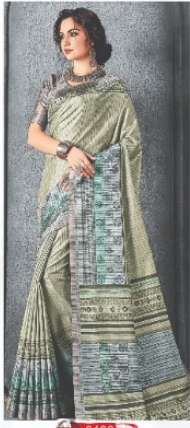
6406 ( MANIPURI SILK )