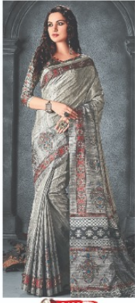
6403 ( MANIPURI SILK )