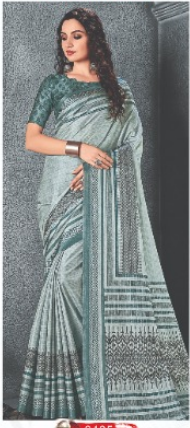
6405 ( MANIPURI SILK )