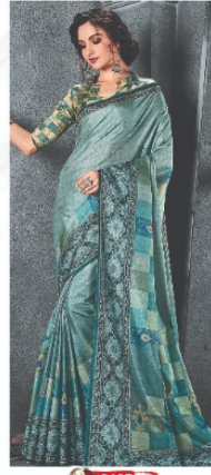
6407 ( MANIPURI SILK )