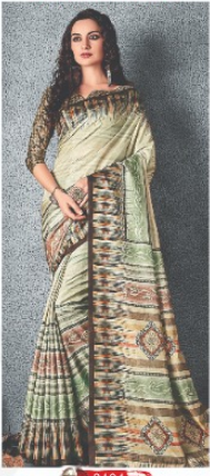
6404 ( MANIPURI SILK )