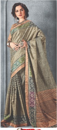
6401 ( MANIPURI SILK )