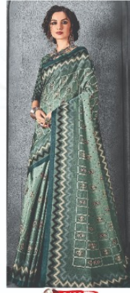
6408 ( MANIPURI SILK )