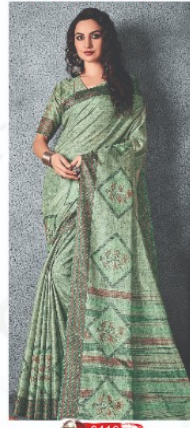
6410 ( MANIPURI SILK )