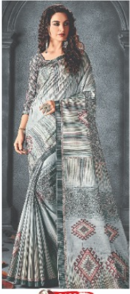
6402 ( MANIPURI SILK )