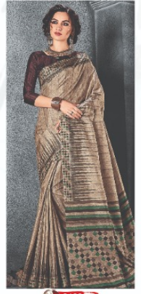
6409 ( MANIPURI SILK )