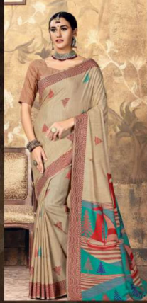
M-27 (COTTON SILK)