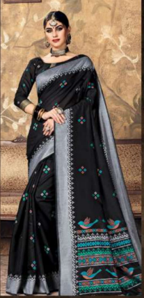
M-22 (COTTON SILK)