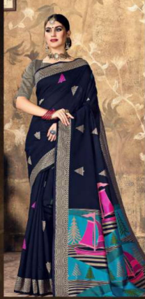
M-28 (COTTON SILK)