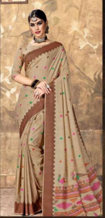
M-23 (COTTON SILK)