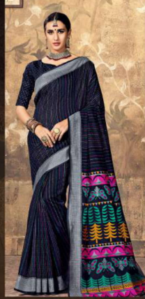
M-26 (COTTON SILK)