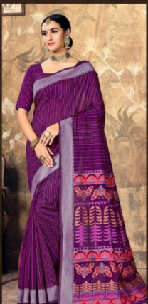
M-25 (COTTON SILK)