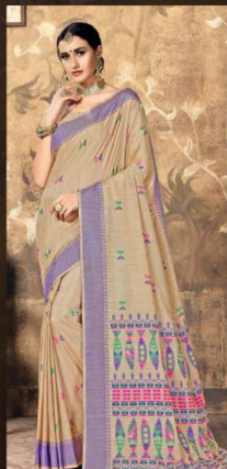
M-30 (COTTON SILK)