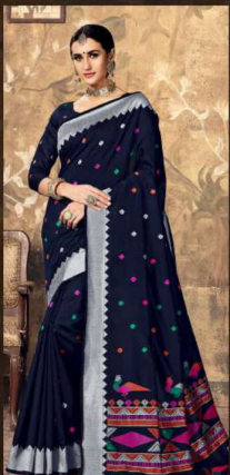
M-24 (COTTON SILK)