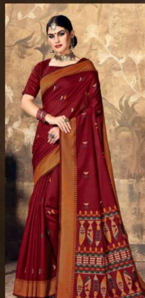
M-29 (COTTON SILK)