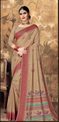
M-21 (COTTON SILK)