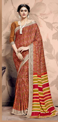
20008 PASHMINA SILK