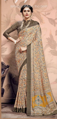
20005 PASHMINA SILK