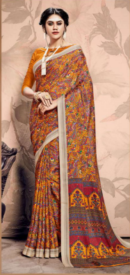
20004 PASHMINA SILK