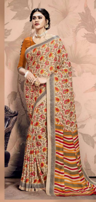
20020 PASHMINA SILK