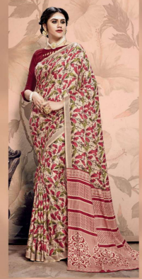
20012 PASHMINA SILK