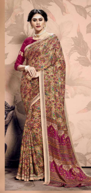
20009 PASHMINA SILK™ Apple Winda, Ganga, the best