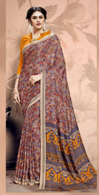
20006 PASHMINA SILK