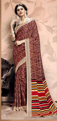
20002 PASHMINA SILK™ Apple Winda, Ganga, the best