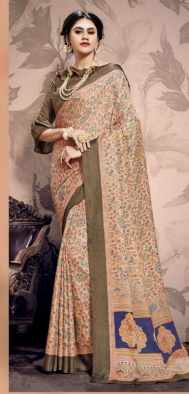
20010 PASHMINA SILK