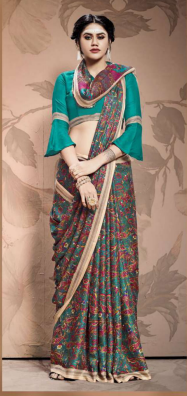
20003 PASHMINA SILK