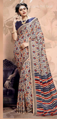
20011 PASHMINA SILK