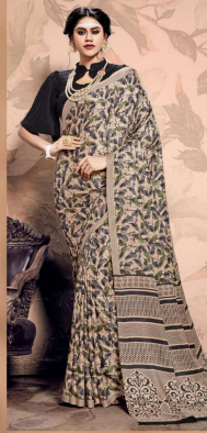
20006 PASHMINA SILK