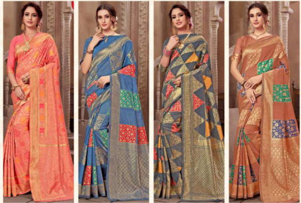
→N-4005← (COTTON SILK)