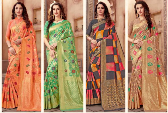
→N-4001← (COTTON SILK)